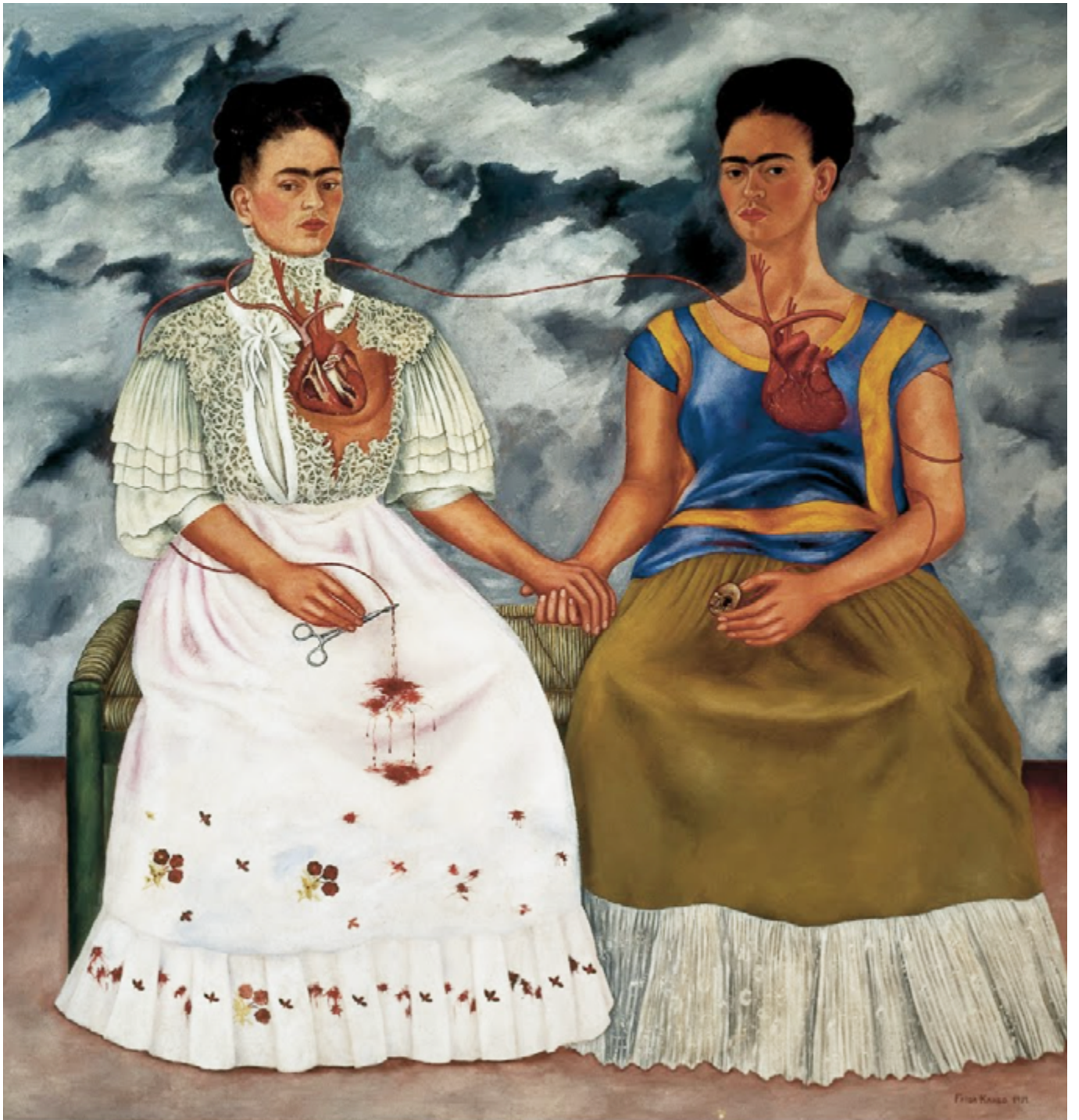
Credit: Frida Kahlo, The Two Fridas (Las dos Fridas), 1939. (Museo de Arte Moderno, Mexico City)